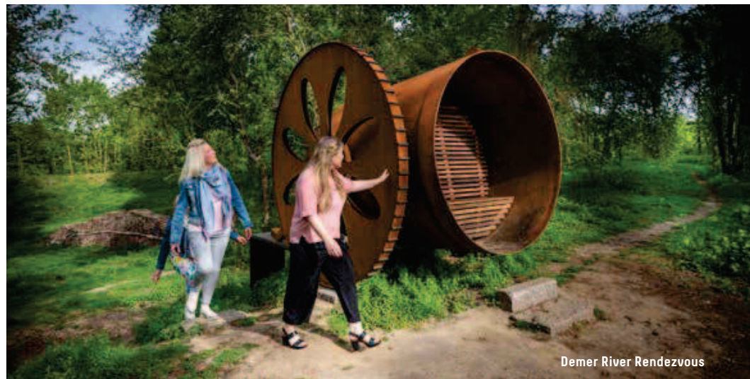
Demer River Rendezvous